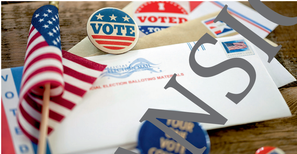
Illustration von Julia Lenzmann, Stuttgart

Die USA haben gewählt. Der neue Präsident der Vereinigten Staaten steht fest: Joe Biden – auch wenn der aktuelle Präsident Donald Trump es noch nicht akzeptieren möchte. Aber wie wird man eigentlich Präsident der Vereinigten Staaten von Amerika? Welche Parteien gibt es und wofür stehen sie? Und was hat der president-elect dem amerikanischen Volk zu sagen? In dieser Einheit erarbeiten die Lernenden anhand eines DIN-A4-Posters und Texten das amerikanische Wahlsystem und die entsprechenden Parteiprogramme. Das Leseverstehen der Lernenden wird außerdem anhand der ersten Rede von Biden als gewählter Präsident geübt und durch Wortschatz- und Analyseaufgaben ergänzt.