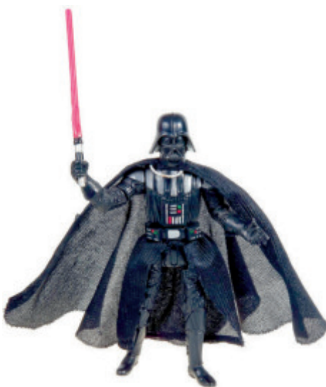
Darth Vader Action Figure