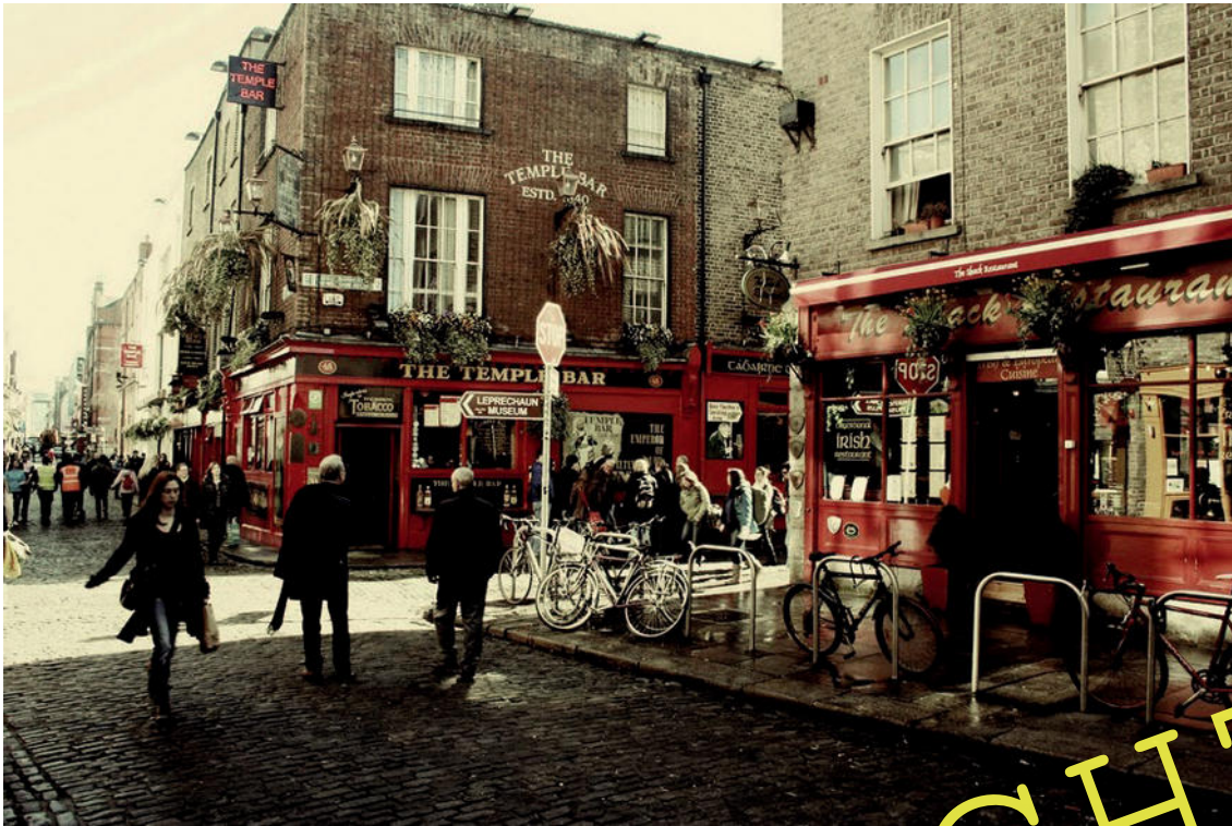
Temple Bar in Dublin, Ireland