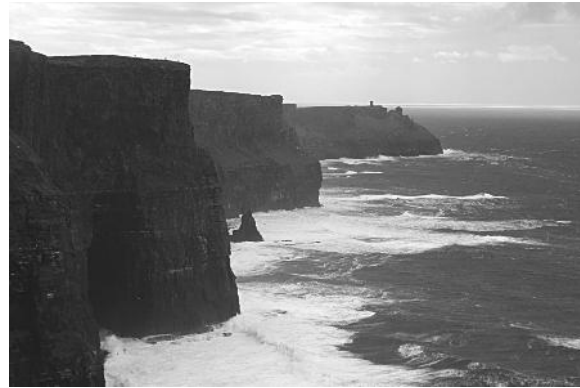
Cliffs of Moher, Ireland

Die vorliegende Unterrichtseinheit ist wie eine Abschlussprüfung aufgebaut. Sie umfasst die Kompetenzen reading , use of English , guided writing und speaking . Die Lernenden erhalten nützlichen Tipps, erarbeiten Bindewörter sowie Redemittel und durchlaufen prüfungsähnliche Situationen. Eingebettet in das Thema „Irland“ verfassen sie zwei Texte im guided writing und diskutieren, was sie bei einer Reise durch das Land berücksichtigen müssen. Am Ende der Unterrichtseinheit erhalten sie eine Rückmeldung zu ihrer Leistung.