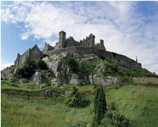
The Rock of Cashel, Ireland

If you ask people about Irish dancing, they will probably mention (probably, mention) Riverdance – The Show . (1) _____ (know) for its rapid leg and foot movements, body and arms being kept largely stationary, Riverdance as (2) _____ (???) as other shows that followed have