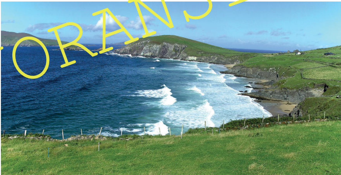
Ring of Kerry, Ireland