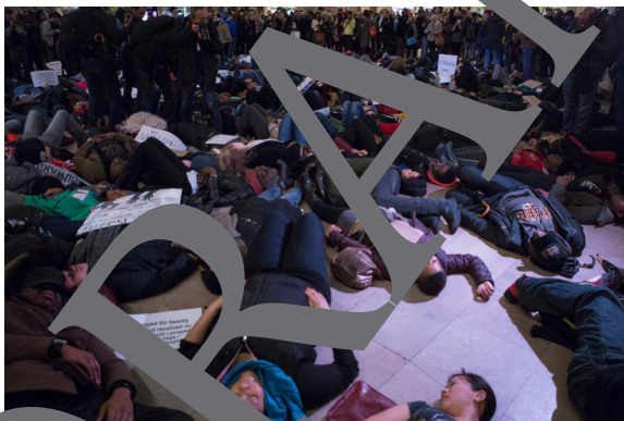
Peaceful protest in New York City on December 6, 2014: Demonstrators are lying on the floor of Grand Central Terminal to protest the death of Michael Brown.

Although the United States has the greatest 9 laws to protect civil rights 9 , some Americans say that the nation has not yet completely succeeded.