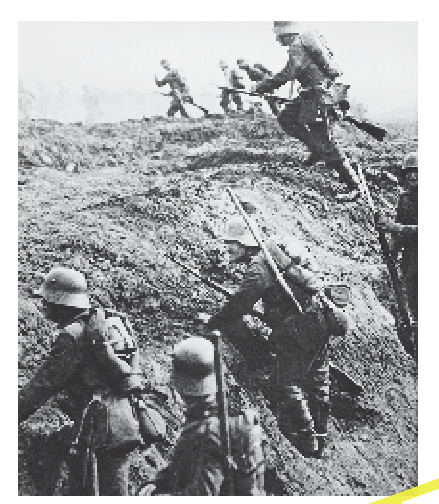
German soldiers leave a trenen for an attack.

<sup>10</sup> "Direct truces were easily suppressed<sup>1</sup>. Orders were issued making clear that the soldiers "were in France to fight and not to fraternize<sup>2</sup> with the enemy" [...]. Several soldiers were courtmartialled<sup>3</sup> and whole battalions were punished. Soon [...] such arrangements became rare." (Axelrod: 78)