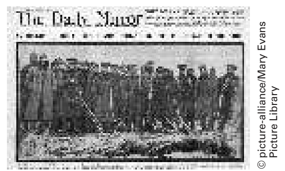
ChristmasTruce of 1914

[...] My eyes caught a [...] light in the enemy's trenches [...]. Then [...] there came to our ears a <sup>15</sup> greeting unique in war: "[...] English soldier, a Merry Christmas [...]!" Following that salute boomed the invitation [...]: "[...] English soldier, come out here to us." For some little time we were cautious<sup>4</sup> [...]. Officers [...] ordered the men to be silent. But [...] one heard the men answering that Christmas greeting [...]. How could we resist wishing each other a Merry Christmas, even though we might be at each other's throats immediately alterwards? So we