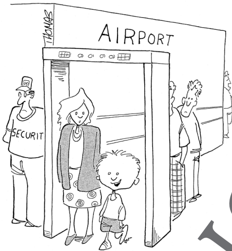
Cartoons B–C: Cartoonstock

"Wow, this is the same model we have seen before."