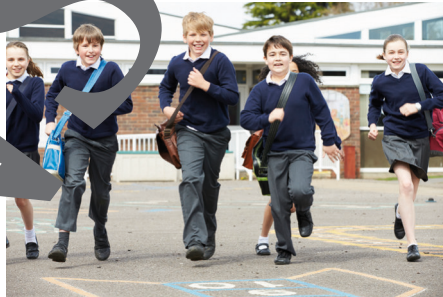
A common criticism is that state schools don't have the same quality as public schools.

10 [...] The UK has its fair share of problems and is still failing in many vital areas, including transport, health and manufacturing (apart from those industries we've sold to foreigners). However, we are still world leaders in pageantry, binge drinking and football hooliganism. Major concerns include rising crime (particularly juvenile and violent crime), the uneven quality of state education, a flourishing drugs culture, the failing health service, inequality (the growing gulf between rich and poor), a looming pensions crisis, pollution, awful public transport, homelessness, overcrowded roads, [...], a spiralling cost of living [...]. Apart from that everything is perfect. [...]